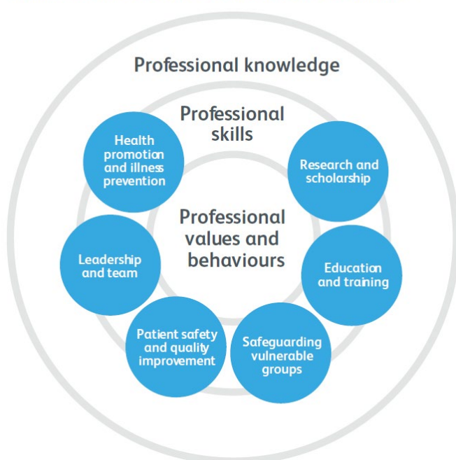
The nine domains of the GMC's Generic Professional Capabilities

Good medical practice (GMP) [11] is embedded at the heart of the GPC framework. In describing the principles, duties and responsibilities of doctors the GPC framework articulates GMP as a series of achievable educational outcomes to enable curriculum design and assessment.