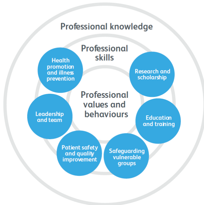
The nine domains of the GMC's Generic Professional Capabilities

Good medical practice (GMP) 11 is embedded at the heart of the GPC framework. In describing the principles, duties and responsibilities of doctors the GPC framework articulates GMP as a series of achievable educational outcomes to enable curriculum design and assessment.