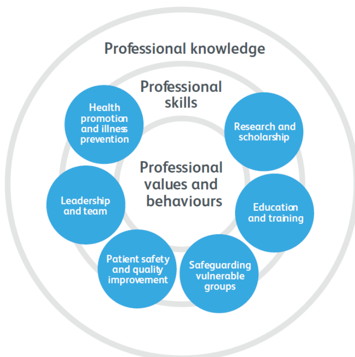
The nine domains of the GMC's Generic Professional Capabilities

The GMC has developed the Generic professional capabilities (GPC) framework with the Academy of Medical Royal Colleges (AoMRC) to describe the fundamental, career-long, generic capabilities required of every doctor. The framework describes the requirement to develop and maintain key professional values and behaviours, knowledge, and skills, using a common language. GPCs also represent a system-wide, regulatory response to the most common contemporary concerns about patient safety and fitness to practise within the medical profession. The framework will be relevant at all stages of medical education, training and practice.