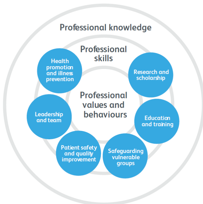
The nine domains of the GMC's Generic Professional Capabilities

Good medical practice (GMP) 3 is embedded at the heart of the GPC framework. In describing the principles, duties and responsibilities of doctors the GPC framework articulates GMP as a series of achievable educational outcomes to enable curriculum design and assessment.